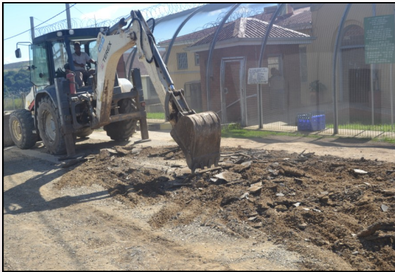
PHOTO: Road in ward 1 being maintained.