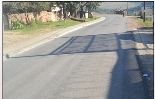
PHOTO: Road in ward 1 after maintenance