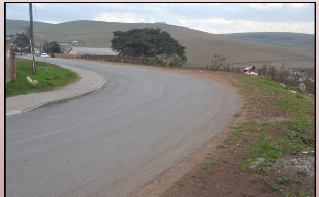
PHOTO: Road After