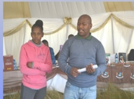
WASTE MANAGEMENT TEAM