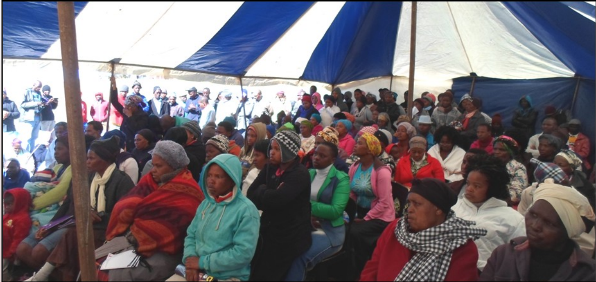
PHOTO: The Nikhwe community during the crime awareness campaign conducted by the youth of ward 17.

Lovelifa in partnership with Mbizana Local Municipality and other departments gathered at Nikhwe Village on the 17 th April 2015 for Community consultation on crime awareness.