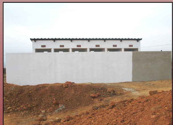
PHOTO: The construction of Newtown Community hall sanitation.