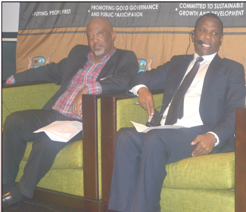
PHOTO: Deputy Minister for Finance, Mcebisi Jonas and MEC for Economic Development and Finance, Sakhumzi Somyo during the panel discussions conducted at the business conference.

The Mbizana Local Municipality held a Business Conference theme 'Economic Infrastructure development' at Wild Coast Casino in Bizana with the aim of helping small businesses reach their full potential so that the economy of Mbizana can also grow.