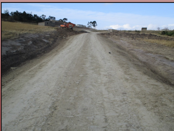
PHOTO: Mayila Access Road under construction