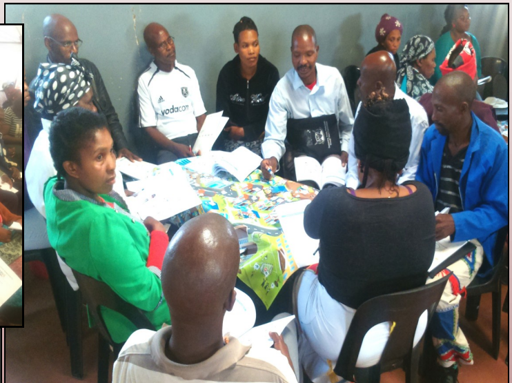
PHOTO: Ward Committees during the workshop conducted by Old Mutual.