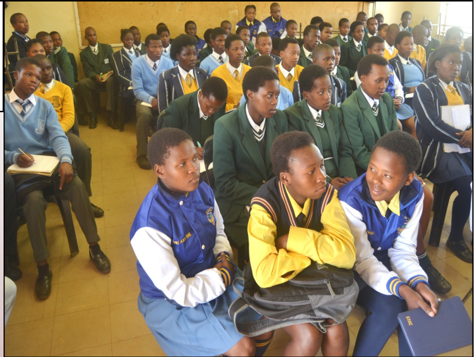
PHOTO: School pupils from different schools in Mbizana during the Career Exhibition conducted by Mbizana Local Municipality.

The Mbizana Local Municipality in partnership with the Department of Education held a Career exhibition during the last week of May for all high schools of Mbizana to equip school pupils on the different career choices and options that will benefit their future.