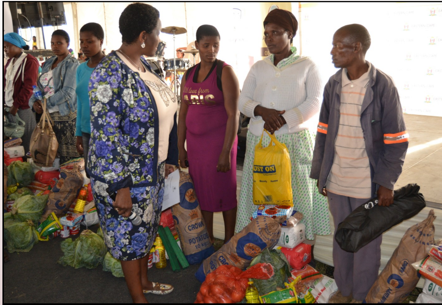
PHOTO: The Minister of Social Development Miss Bathabile Dlamini having face to face chats with the beneficiaries from Mbizana.

The minister of Social Development Miss Bathabile Dlamini visited Mbizana as part of Imbizo week on April 10, 2015 at Mputumi Mafumbatha Stadium.