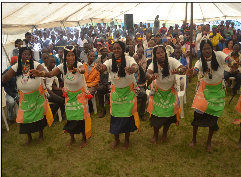
PHOTO: The community of Dyifani rejoicing to the initiative done by the ECRDA on informing them about agricultural activities.

The Eastern Cape Rural Development Agency (ECRDA) held an information Day at Dyifani Village on the 18 March 2015 to educate farmers and the community on how to make job opportunities through agriculture and to check on the progress of the factory that is being built in Mbizana.