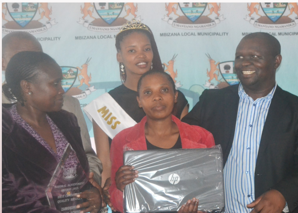
PHOTO: The honourable mayor from Mbizana Local Municipality handing over a laptop to one of the beneficiaries who produced excellent results in 2014.

The Mbizana Local Municipality in partnership with the Department of Education held a schools Achievement Awards day in May 2015 at Chief Dumile Senior Secondary School in order to applaud those students who have excelled in 2014 academic year.